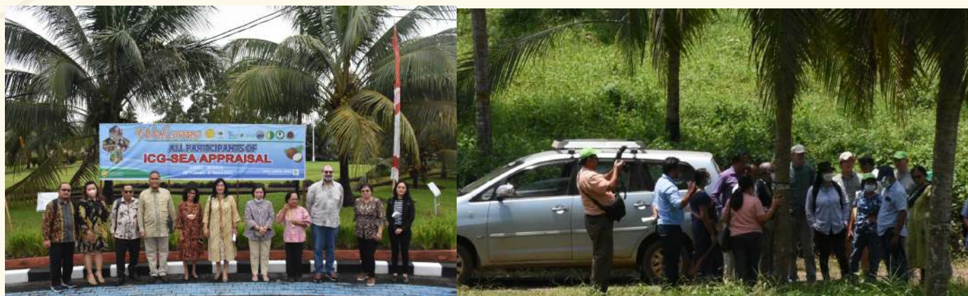
(Left) Appraisal in ICG-SEA held in Manado, Indonesia; (Right) Appraisal in ICG-SAME held in India

Generally, conservation aims to prevent loss of crop genetic diversity worldwide. Hence, international agreements have been designed to encourage preservation of genetic diversity and promote the exchange of germplasm. The FAO International Treaty on Plant Genetic Resources for Food and Agriculture governs the exchange of germplasm for crops but, implementation has been hampered by a lack of consensus among the treaty's parties on the value of genetic resources. Thus, challenges of germplasm conservation must be addressed to ensure the sustainability of the conservation activities especially in the case of coconut being an economic and long-term crop which is logged to the accountability of COGENT.