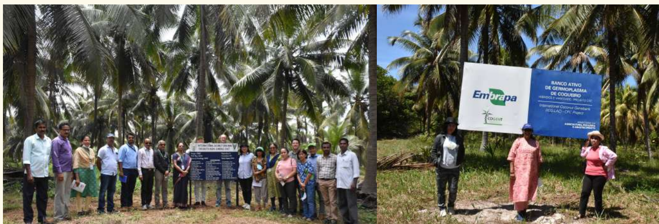
(Left) Appraisal in ICG-SAME held in India; (Right) Appraisal in ICG-LAC

Empirical data from the reports and the actual observations were the basis of comparison. The appraisal also focused on the strategies adopted and field management appraising the effects both the pros and cons to identify technology needs and gaps to be addressed at the immediate which will be based on the appraisal outputs. In the same manner that policy initiatives include broad-based programs of multilateral and bilateral financial assistance, stronger intellectual property rights, and international agreements for germplasm exchange were considered. In addition, the idea of appraising the cost of establishing and maintaining ICGs was estimated to integrate income-generating activities to augment the sustainability plan for the genebanks.