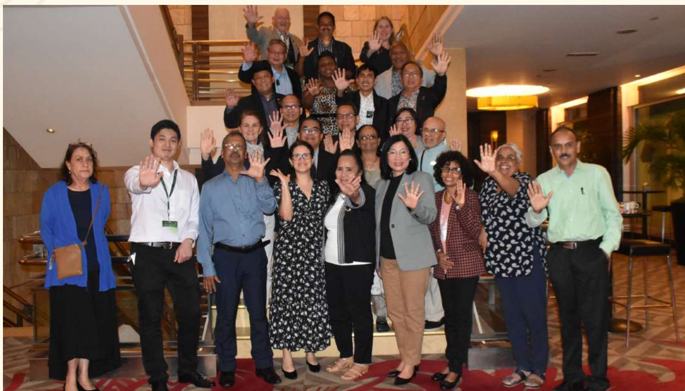
(Participants in the COGENT's Steering Committee Meeting and ITAGs Workshop in Hotel Impiana, Kuala Lumpur, Malaysia on November 12, 2022)

In the recent COCOTECH Conference held in Kuala Lumpur, Malaysia from November 7-12, 2022, these strategies were presented as COGENT's logical approach. Coming up with the prospects in the coconut industry served as the key driver to bring back the COGENT's energy to achieve better germplasm management and exchange with the end goal of using of genetic resources as the essence of conservation and utilization. Hence, the conduct of genebank appraisals and series of consultations with ITAGs provided the core basis of formulating strategies to address identified challenges and needs. To effect strict compliance to the treaty of conservation and be responsive to the agreed responsibilities of the host countries of the genebanks, to have consultative meeting and get hold of the policy makers commitment were recommended. Likewise, priority researches to optimize and standardize the use of the CTC and Cryopreservation protocols as potential tools for better conservation, better germplasm exchange and mass propagation is vital.